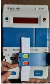
Fixing Green Paper Seal